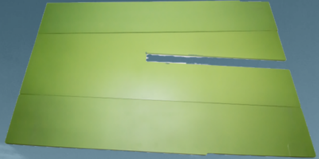
PANEL AFT CTR; RMA-C6FS3474-15 PANEL AFT LH; RMA-C6FS3474-9 PANEL AFT RH :RMA-C6FS3474-11

Our aluminum honeycomb sandwich construction ensures a strong replacement panel to increase the life of your twin otter interior and improve the look of its cabin.